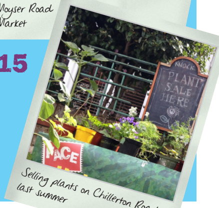
Selling plants on Chillerton Road last summer