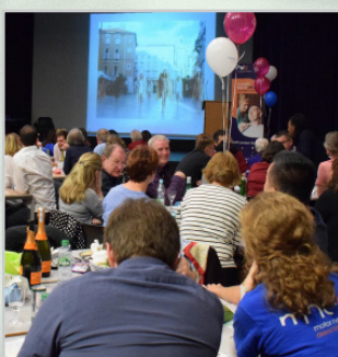
2015 Charity Quiz Night