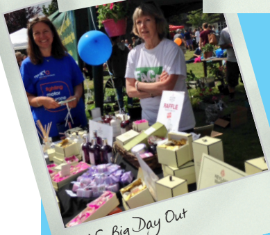
2015 Big Day Out

AND LOOKING FORWARD TO SEEING YOU AT OUR FUTURE EVENTS!