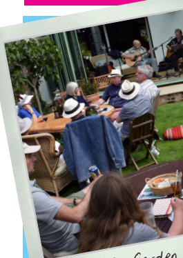
2015 FACE Garden Gig and BBQ