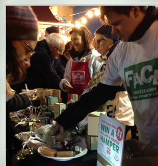
2015 Moyser Road Winter Market