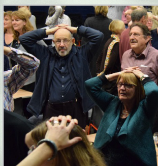
2015 'Heads & Tails' game